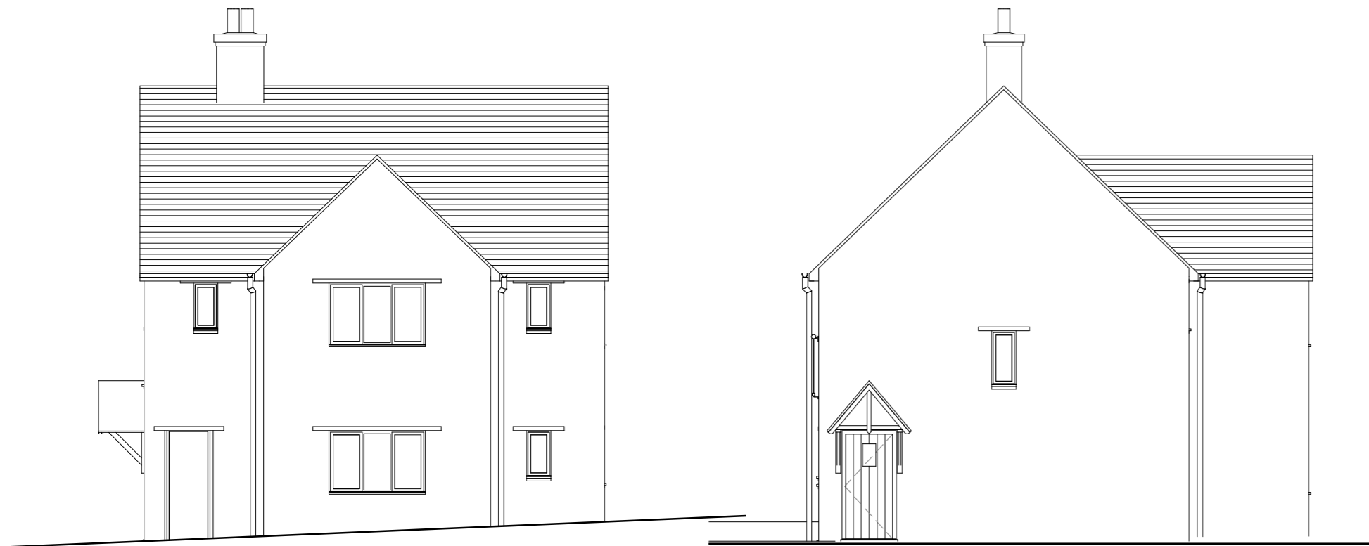
3 Front Elevation 1 : 100