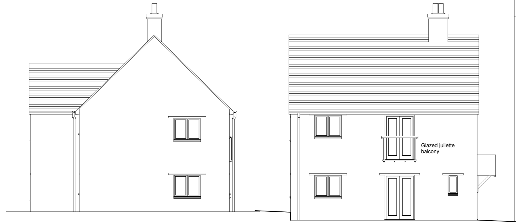
6 Elevation - West Gable 1 : 100