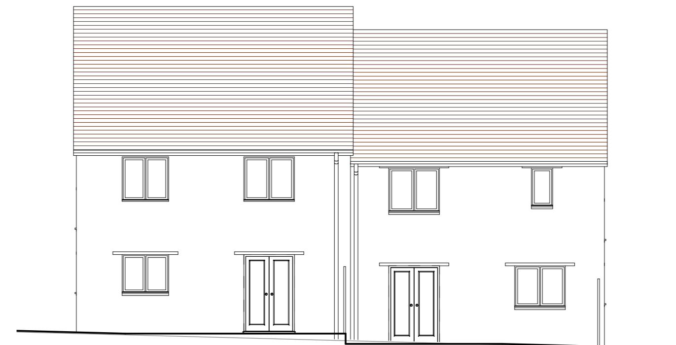
4 Rear Elevation 1 : 100