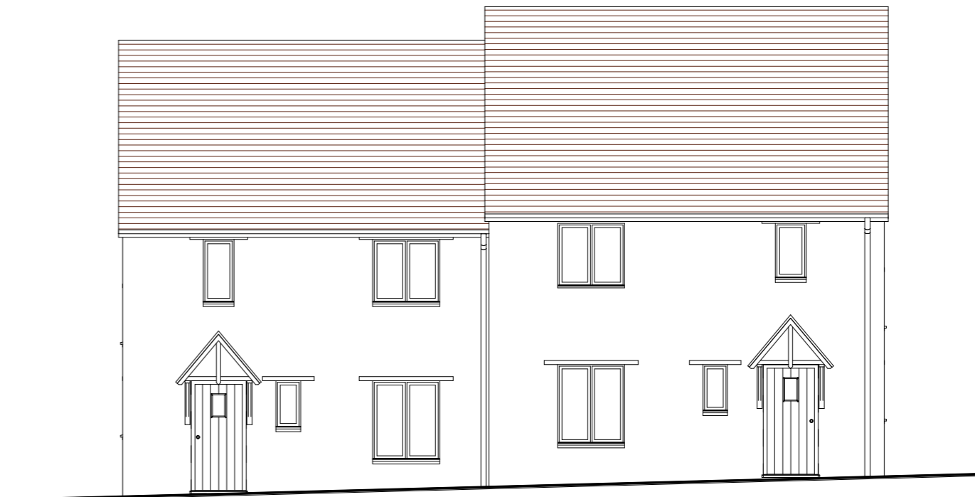
3 Front Elevation 1 : 100